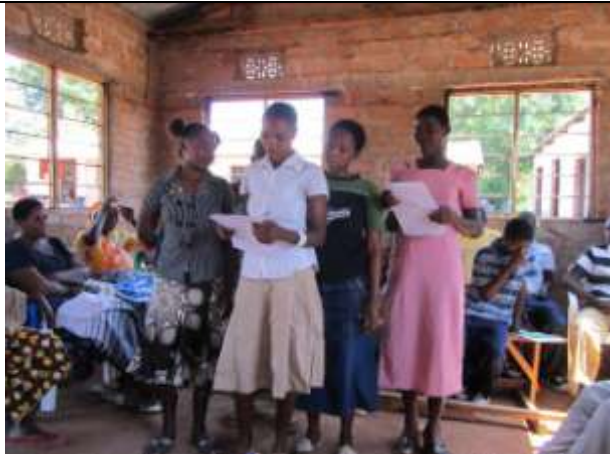
Female youth providing a report at a village meeting in Tanzania.

176 Gloucester Street, Suite 320, Ottawa, Ontario K2P 0A6, www.aic.ca